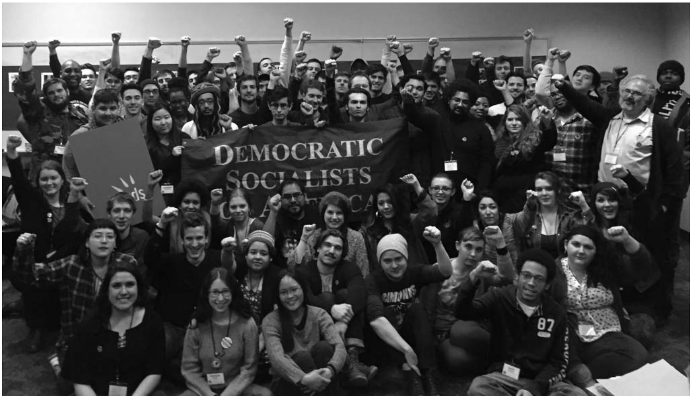
Young Democratic Socialist youth gathered in New York City for the annual winter conference February 13-15, 2015.